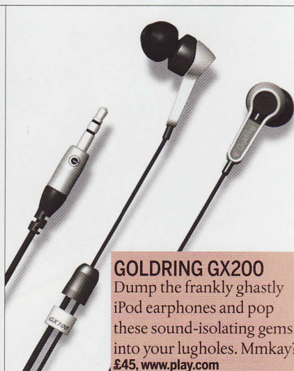
GOLDRING GX200 Dump the frankly ghastly iPod earphones and pop these sound-isolating gems into your lugholes. Mmkay? £45, www.play.com