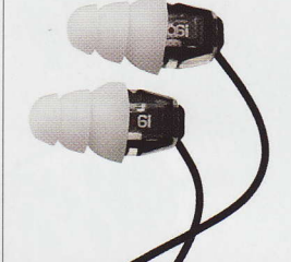
ETYMOTIC ER-6I Designed specifically with the iPod in mind, the ER-6's 'flanged' tips seal your ear canals up good and proper. £70, www.iworld.co.uk