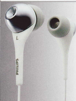
PHILIPS SHE9501 Cheerful in-ears from the Dutch giant. They urinate on most bundled 'phones, yet cost really very little. £13, www.amazon.co.uk