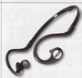
BEYER DYNAMIC SX10 For the muscular gent who craves earphones that say, "I Am Sport". They also fold up in a trice, for storage. £17, www.amazon.co.uk