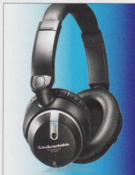
AUDIO TECHNICA ATH-ANC7 Cancels noise like the cold vacuum of space, delivering liquid hi-fi to your cranium. £120, www.audio-technica.com