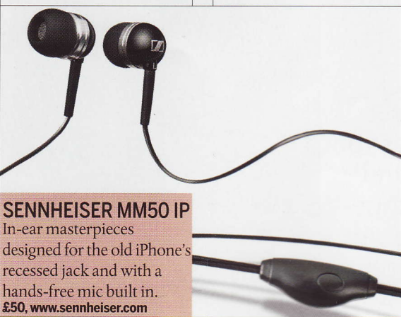
SENNHEISER MM50 IP In-ear masterpieces designed for the old iPhone's recessed jack and with a hands-free mic built in. £50, www.sennheiser.com