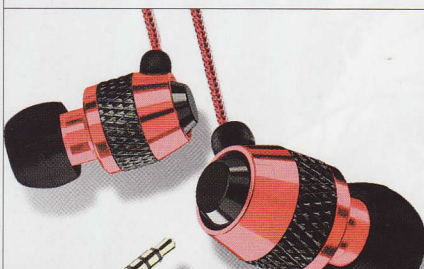
V-MODA VIBE Available in numerous hues, including the glorious red number shown here. They sound the business, too. £55, www.amp3.co.uk