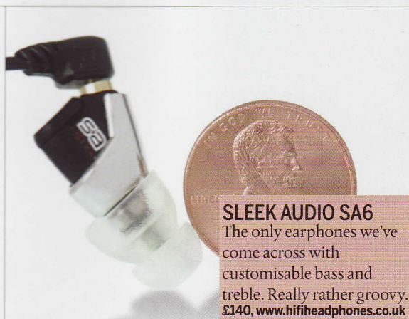
SLEEK AUDIO SA6 The only earphones we've come across with customisable bass and treble. Really rather groovy. £140, www.hifiheadphones.co.uk