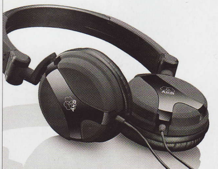
AKG K518 DJ High sound pressure, closed-back cans for use in noisy environments such as the number 37 to Peckham. £48, www.iheadphones.co.uk